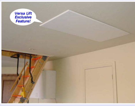
Versa Lift Auto-Close™ seals the ceiling opening and automatically adjusts for joist heights to 18"