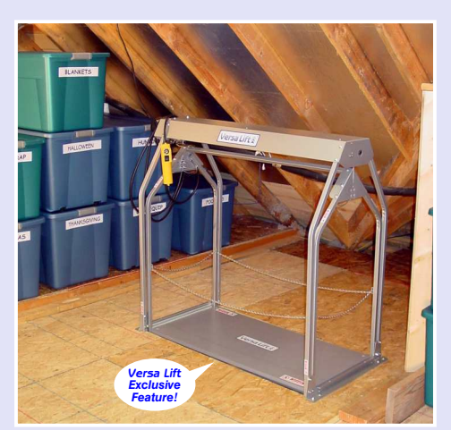
Versa Lift Level-Up™ system raises the platform flush to attic floor to unload cargo with no lifting.

(Common to All Models) 18" (for Auto-Close™ Feature) 8" per sec (8-ft in 12 sec) .093 steel - 1,000 lb break 110 volt AC, 60hz, 4.5 amp